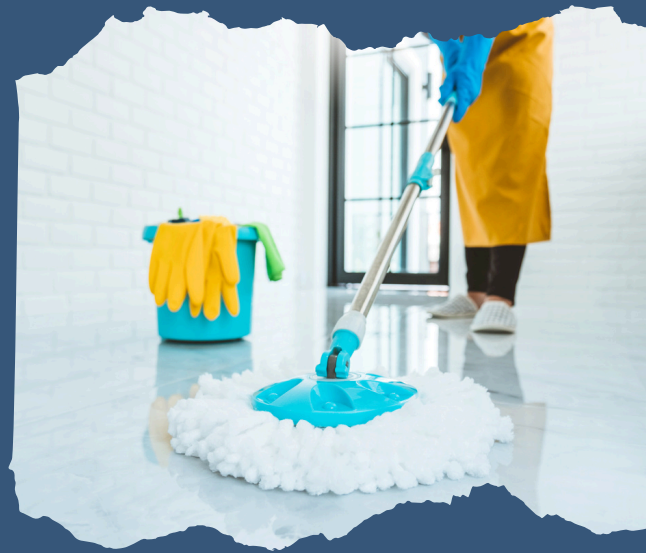
HOUSE KEEPING MANAGEMENT