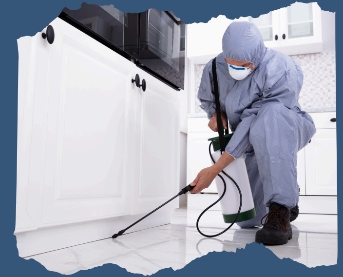
PEST CONTROL MANAGEMENT