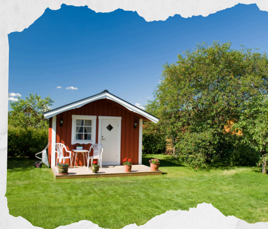
GUEST HOUSE MANAGEMENT