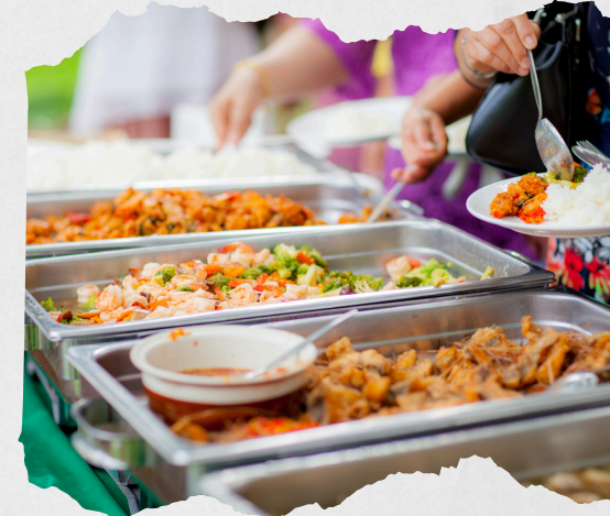
INDUSTRIAL CATERING SERVICES